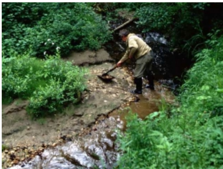
Collecting a Heavy Mineral Stream sample in Russia

Geochemical analysis of indicator minerals by electron microprobe is carried out routinely at the GeoScience Centre (GSC). The results of this analysis provide two important types of information. First, are the minerals mantle-derived or not. Second, are they derived from inside or outside the diamond stability field? Recent developments in trace-element analysis provide further information regarding the geothermal gradient within the mantle (important for interpreting likely preservation or resorption of diamonds), and confirming derivation from inside or outside the diamond stability field. This data provides information useful in determining if the source kimberlites are likely to be diamondiferous (and therefore worth finding), and also for prioritising areas for follow-up.