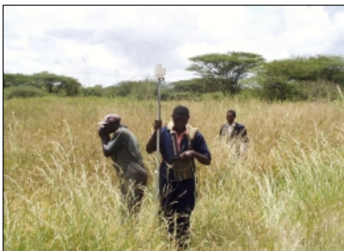
Conducting a ground Magnetics survey in Tanzania

Gravity surveys depend on density contrasts between kimberlite and country rocks. The gravity technique is ground-based (although efforts are being made to develop airborne systems), and is slow and laborious to undertake. However, it may be used to delineate an intrusion.