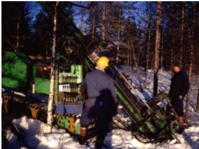
Target drilling in Russia

If the rock sample collected is identified as potentially diamondiferous, a sample is submitted to the KAL for microdiamond analysis. Microdiamonds are defined as diamonds under 0.5 mm in diameter. Microdiamond data is a relatively cheap technique used to obtain a first order estimate of grade.