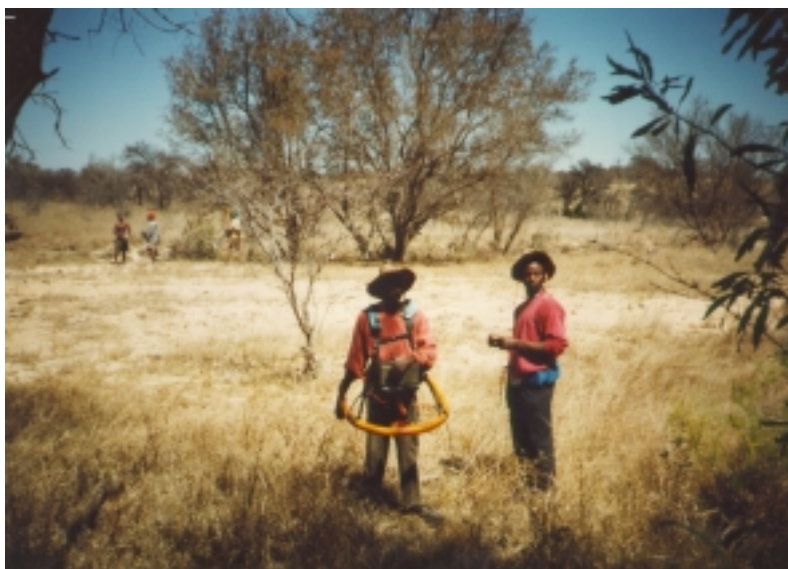
Conducting an Electromagnetic Survey in Zimbabwe

Geophysical techniques are applied in diamond exploration on a regional scale to delineate structure and to help define cratonic areas and on a local scale to detect anomalies associated with kimberlite intrusions. They may also be used during drilling in the form of a down-the-hole tool designed to collect information useful in logging a borehole. Although geophysical techniques have discovered a large number of kimberlites, no diamond mine has yet been discovered using geophysical techniques as the primary tool.